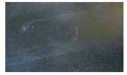
Figure 5: under side of upper mat after continuous tread load

Evaluation scale: ++/+/ \circ /-/--( \circ = standard)