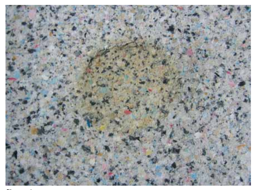
Figure 4: foam after continuous tread load

Evaluation scale: ++/+/ \circ /-/--( \circ = standard)